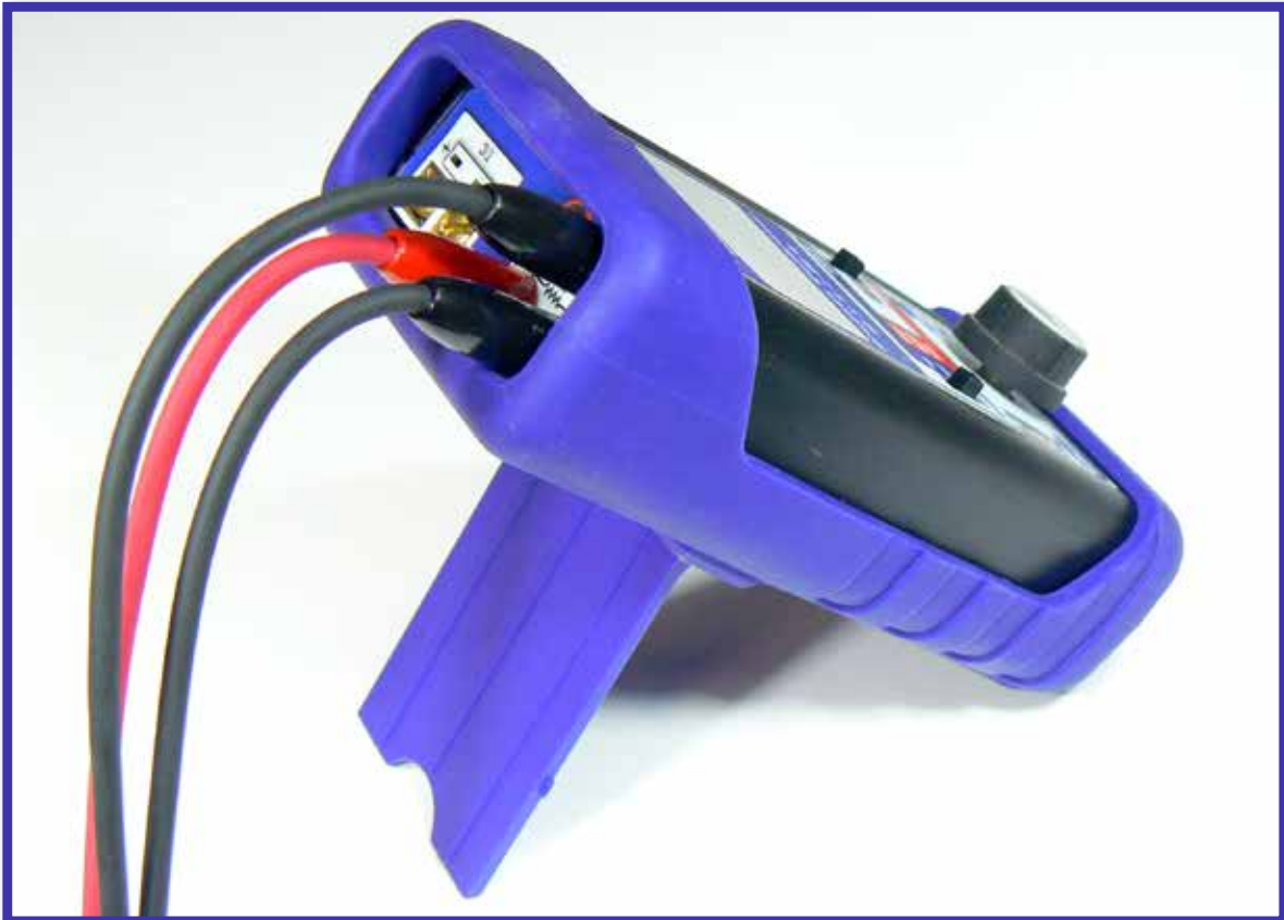
Flip out stand for bench use